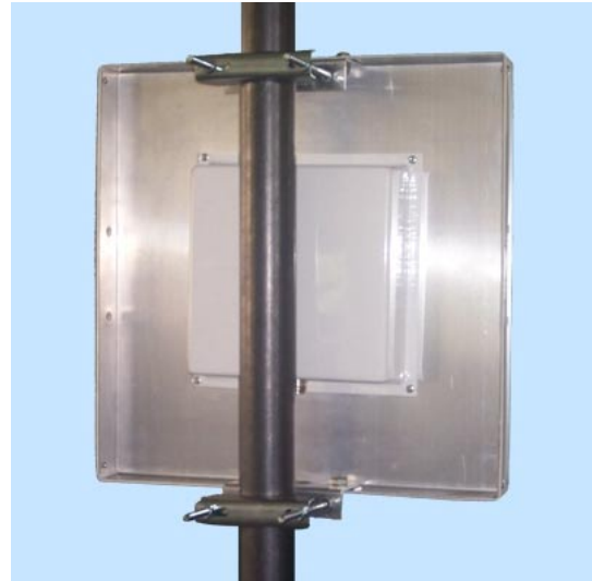
vertical polarization if mounted as shown