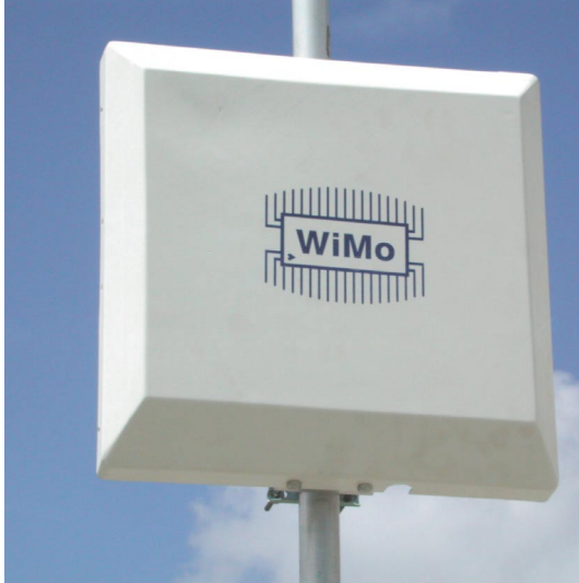
im Bild mit vertikaler Polarisation montiert

Encapsulated outdoor antenna with radome with a gain of 17 dBi. Supplied with mast bracket suitable for 35 to 65 mm dia.